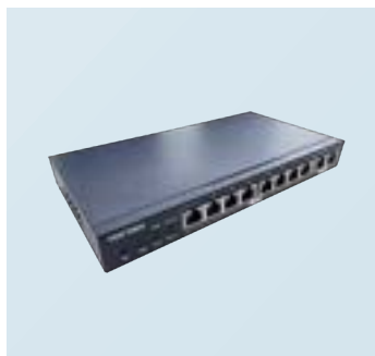
Router with multiple ports for small residential complexes