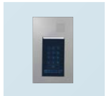
FG Smartcall IoT intercom for smartphones anywhere