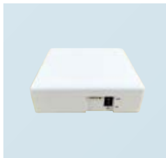
Managed Router with Access Point for small stores