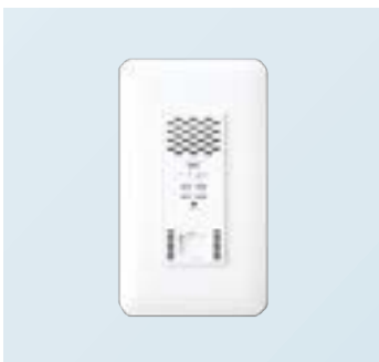
Wall-Mount Access Point for individual rooms